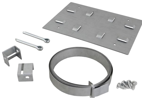
Fig. 1 The view of the package content