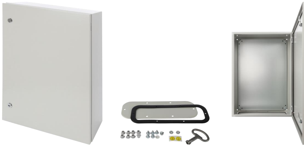
Fig. 1. View of enclosure.