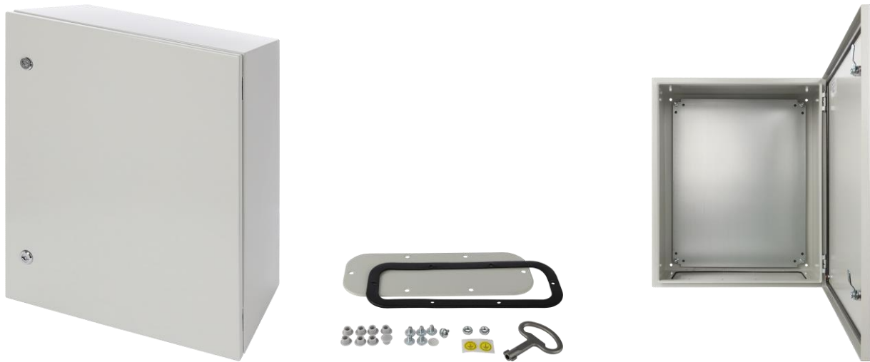
Fig. 1. View of enclosure.