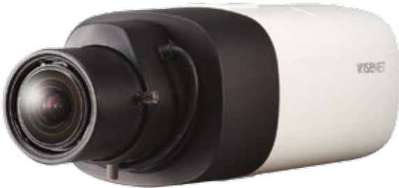
* Lens not included