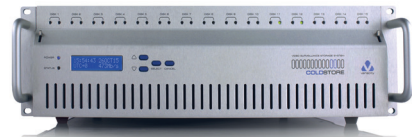
COLDSTORE 3U Front Panel includes LCD system info and disk status LEDs

COLDSTORE 3U is ideal for projects requiring affordable high storage capacity, extended disk lifetimes, long file-retention and simple system management.