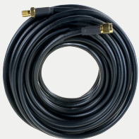
TIMENET Pro Antenna Extension Cable 10 metres