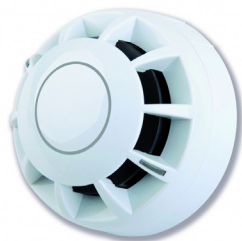
Illustration shows a CA416 CAST smoke detector mounted on a CA408 base. The smoke detector has a grey colour coded ring.