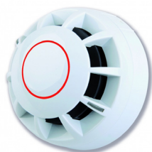
Illustration shows a CA402 CAST heat detector mounted on a CA408 base. The heat detector has a red colour coded ring.