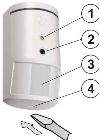
Figure: 1 – flash for illumination; 2 – camera lens; 3 – PIR detector lens; 4 – cover tab;

The detector can be installed onto a wall or in the corner of a room. There should be no obstacles which quickly change temperature (electric heaters, gas appliances, etc.) or which move (e.g. curtains hanging above a radiator) or pets in the detector's field of sight. It is not recommended to install the detector opposite to windows or floodlights or in places with over-intense air circulation (close to ventilators, heat sources, air conditioning outlets, unsealed doors, etc.). There should be no obstacles in front of the detector which might obstruct its view.