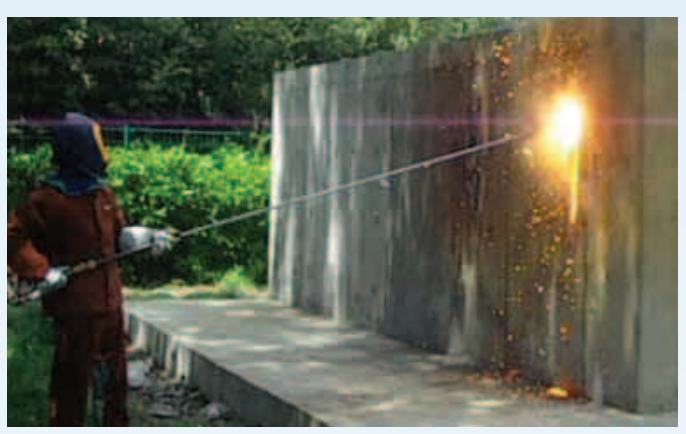
Thermic Lance at over 2500°C