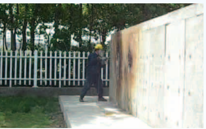
Standard Concrete Drill