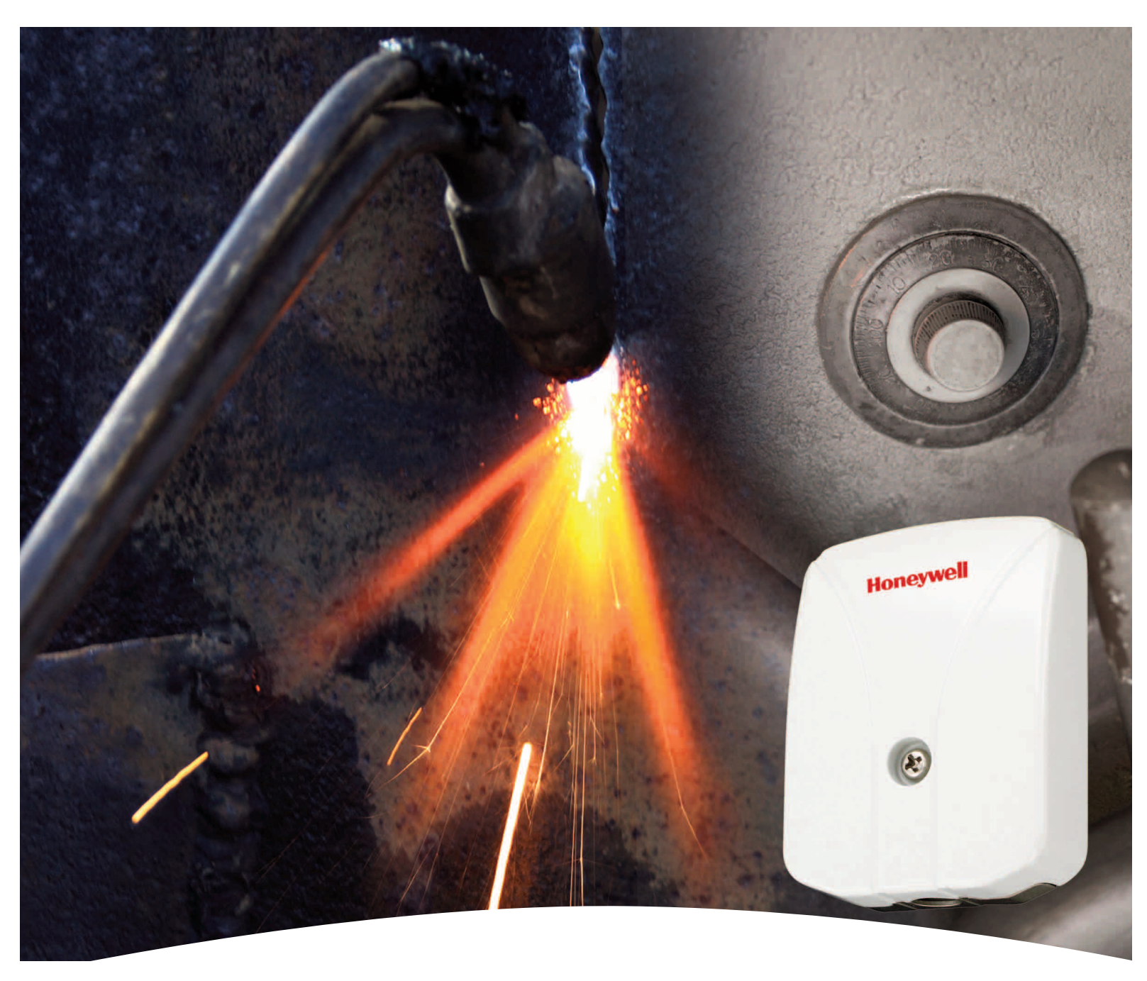
PROTECT BANK VAULTS, SAFES, ATMS AND MORE