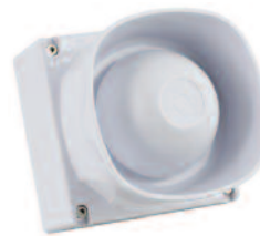
WP version white